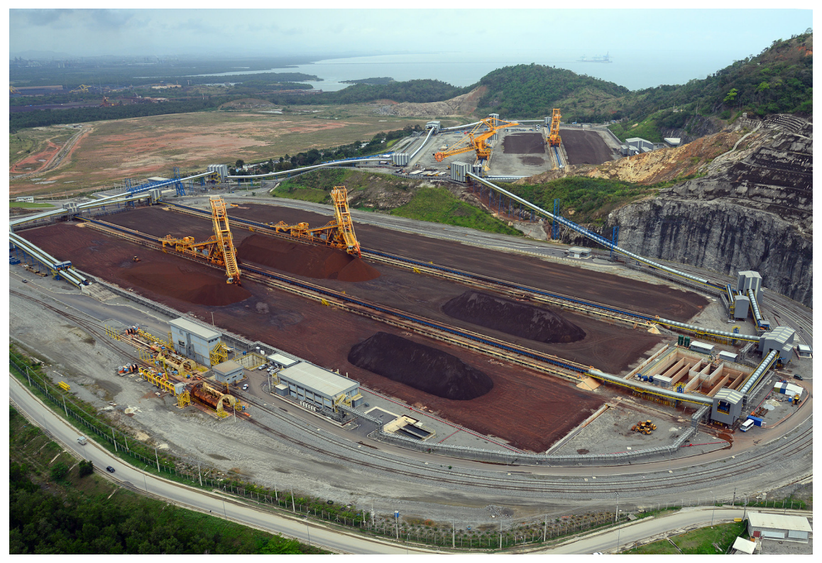
Storage yards covering 250,000 \ensuremath{\text{m}}^2.