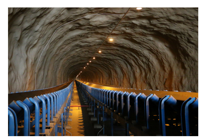
Sophisticated subterranean conveyor belt running 1.8 kilometres.