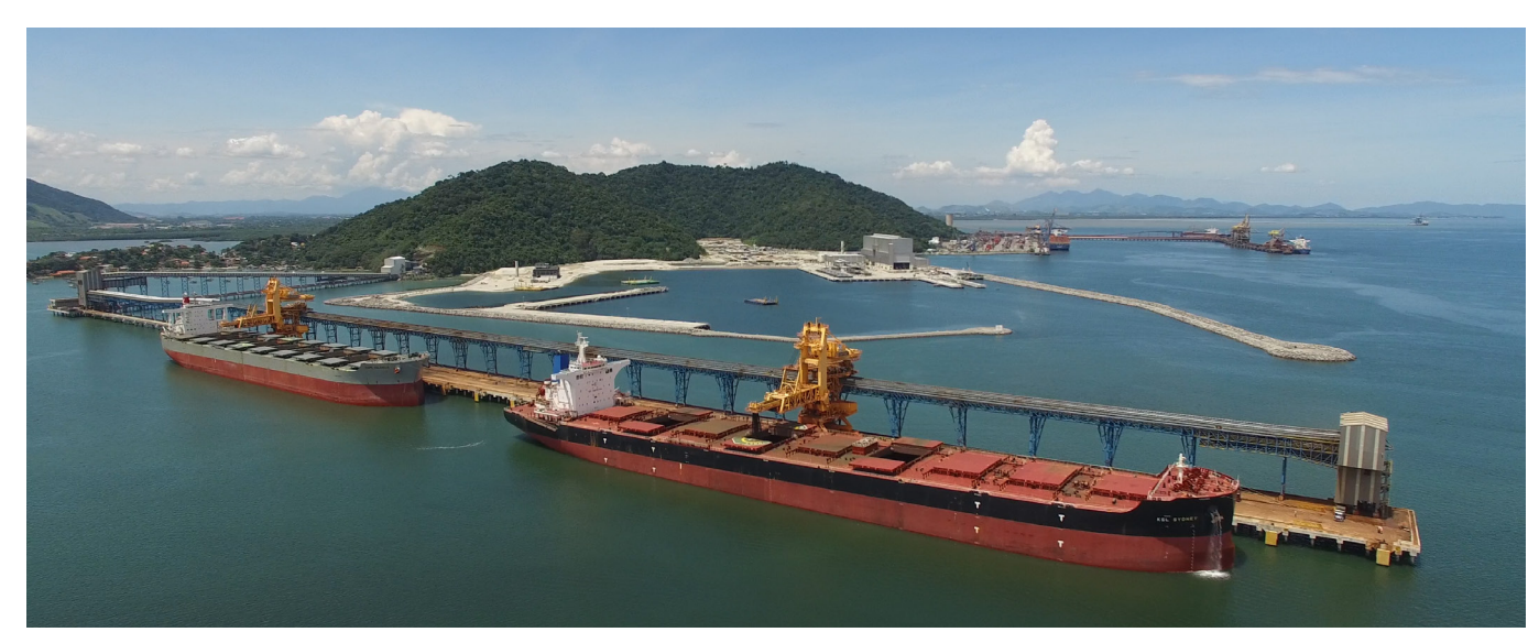
Iron ore is sent to the berths via a mountain tunnel specially constructed for the port.