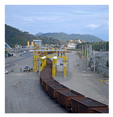
Highly efficient, automated and secure logistics chain from the mine to the port.