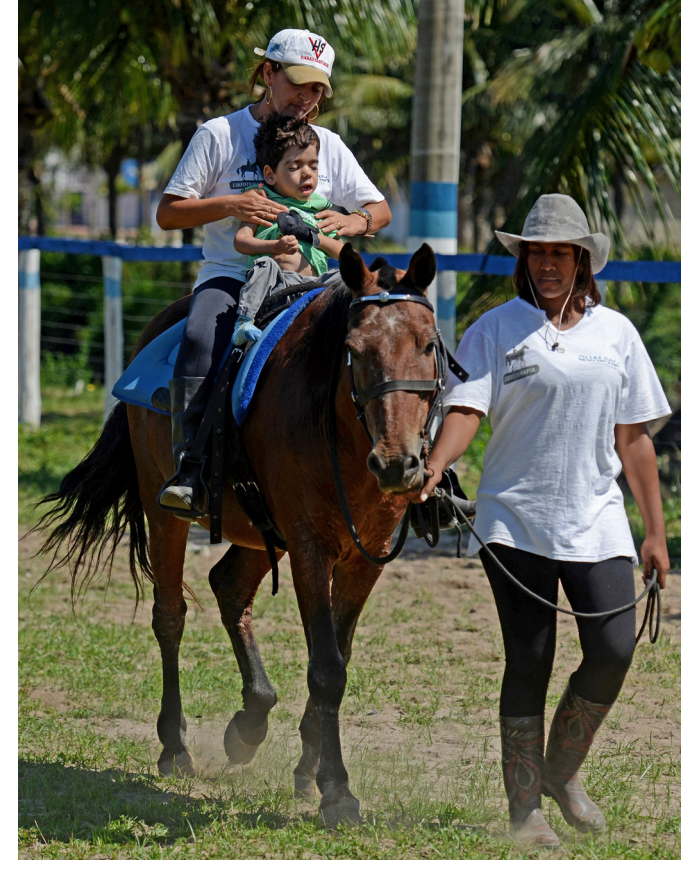
Equoterapia - hippotherapy programme.