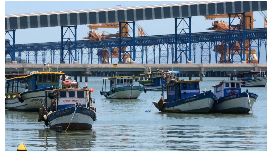
Impala works to strengthen local artisanal fishing.

Our commitment is to ensure that our activities are environmentally balanced, economically prosperous and socially fair, always promoting continuous improvement and human development. As the market for iron ore improves, Porto Sudeste will be a vital lifeline to world markets for producers in the 'iron ore quadrangle' of Minas Gerais state.